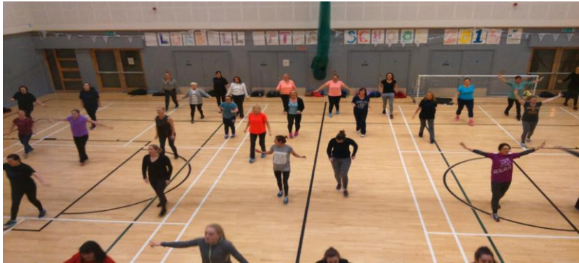
Enjoying Zumba class

The programme is averaging over 55 per class and the aim is to encourage the participants to continue a healthy lifestyle for the rest of the coming year.